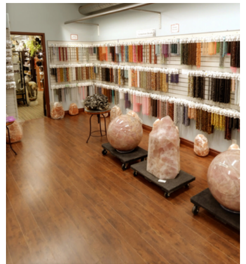
Bead Strand Wall - Featuring Boulder Lamps and Museum Size Specimens