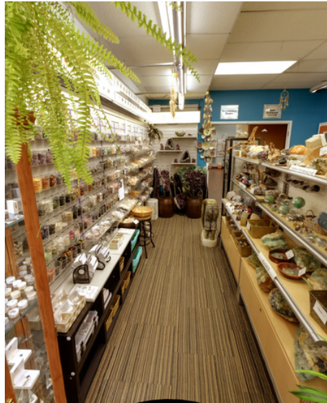
Tumbled & Rough Stone Wall - Organized by price & alphabetically