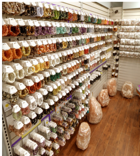
Bracelet Wall - Rounds, Chips, Tumbled, Chakra, Offset Styles